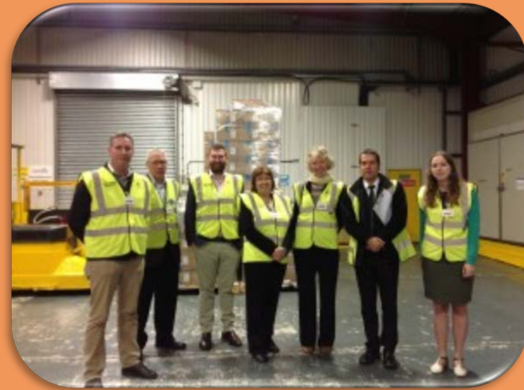
IMTA Visit of Heathrow Border Inspection Point